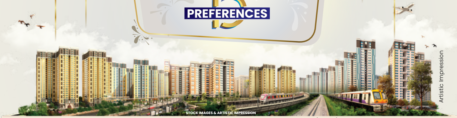
STOCK IMAGES & ARTISTIC IMPRESSION

Vashi | Bamandongri | Kharkopar | Kharghar | Mansarovar | Khandeswar | Kharghar East (Taloja) | Panvel | Kalmaboli